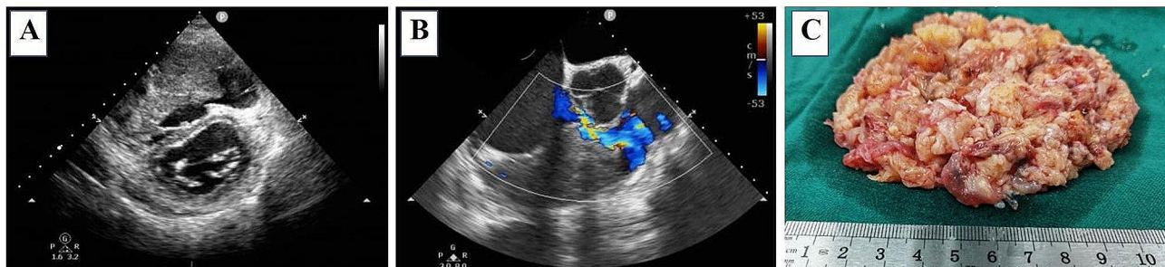
Fig. 1 (A) and (B) represent transthoracic short axis section of LV and the mid-esophageal RV inflow-outflow view. Both TTE and TEE showed a huge mass occupying the inflow tract and most of the right ventricular cavity. The mass fused and wrapped with the tricuspid valve, and the demarcation between the tumor and the myocardium was not clear. The patient had a narrow gap to provide forward blood flow during diastole. (C) shows the excised fragmented tumor tissue

On the day of surgery, transesophageal echocardiography (TEE) further confirmed the mass was approximately 90 mm in size and the tricuspid valve was seriously involved (Fig. 1B). CPB was performed using a roller pump, hollow-fiber oxygenator, and moderate hypothermia. Two filters were placed in the CPB circuit to prevent possible tumor debris and microemboli from entering the circulation. The circuit was primed with 200 mL of Lactate Ringer's solution, 1000 mL of Succinylated Gelatin Injectiol and 3,750 U of heparin. 27,500 U (400 U/kg) of unfractionated heparin was injected intravenously after thoracotomy, with a resultant activated clotting time (ACT) value of 999 s observed. CPB was then commenced, with the flow rate of 2.4–2.6 L/(min·m 2 ). After opening the right atrium, the tumor was noted to infiltrate into the endocardium and myocardium, and extend to the anterior, posterior, and septal leaflets of the tricuspid valve. An en-bloc resection was not possible, but an aggressive debulking procedure was performed. The resected tumor fragments are shown in Fig. 1C. Then, under small-dose vasoactive drugs and inotropic support with epinephrine (0.03 μg/kg/min) and norepinephrine